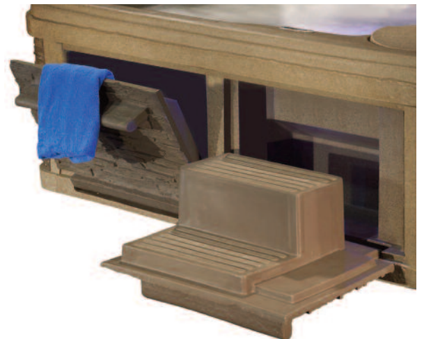
Foldaway Steps & Towel Holder Feature!

Jets: 28 Stainless Steel including 12 Adjustable Jets Seats: 6 including lounger Dimensions: 74.5 x 74.5 x 32 in. Volume: 300 US Gallons Insulation: Polyurethane insulation injected in panels with EPS reflective-backed foam sheeting Operation: 120/240V Plug & Play with 2BHP 2-spd pump and 1KW/4KW Stainless Steel All-Weather Heater