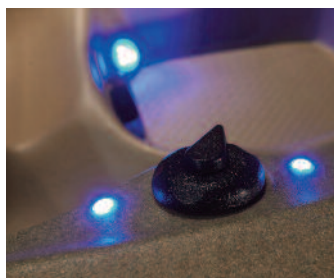
LED Points of Light